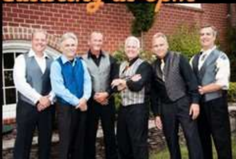
SPECIAL OCCASION BAND (SOB)